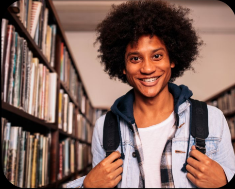
Capture the Moment